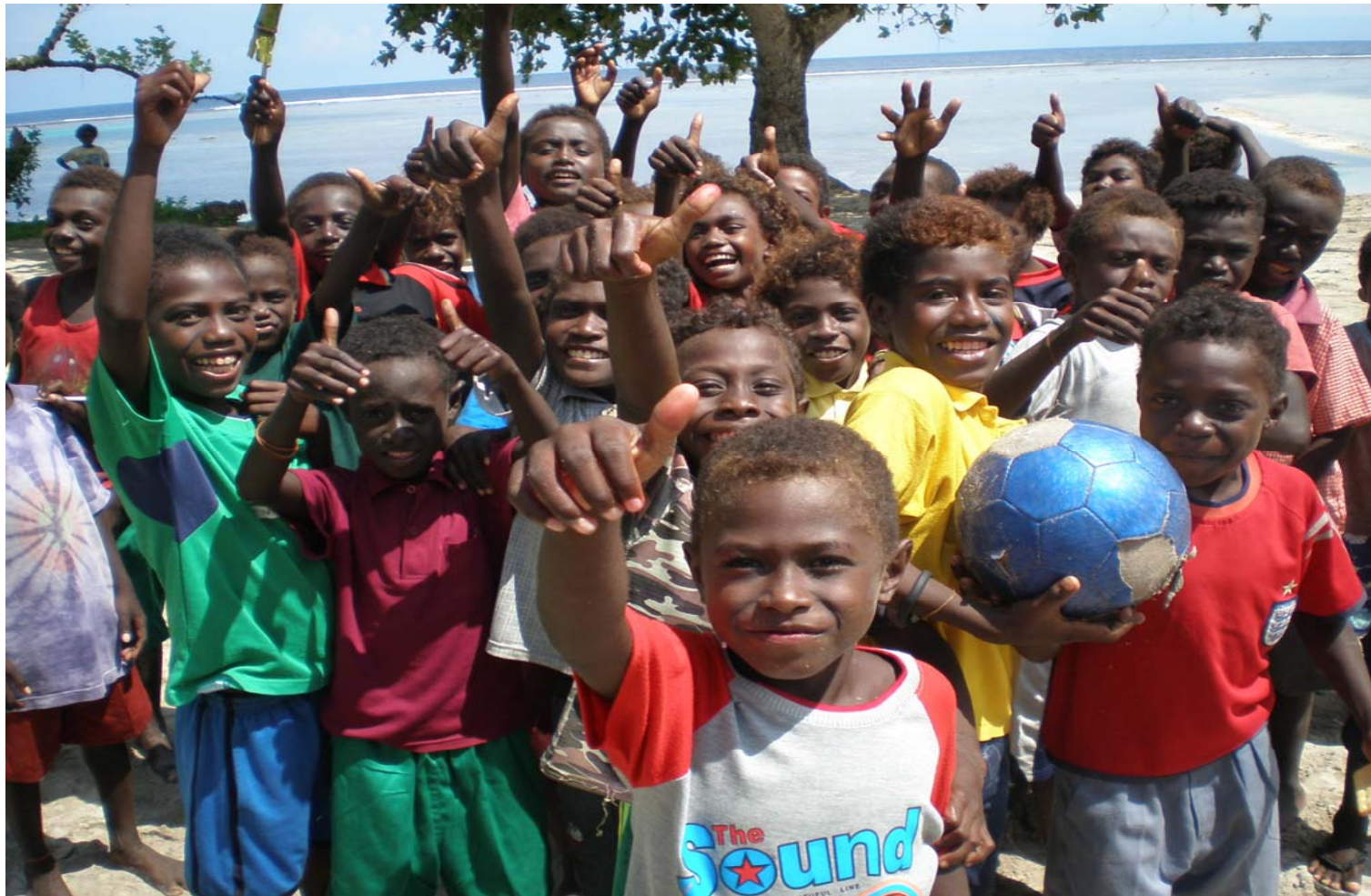
Students of Lontis Elementary School in the Autonomous Region of Bougainville..